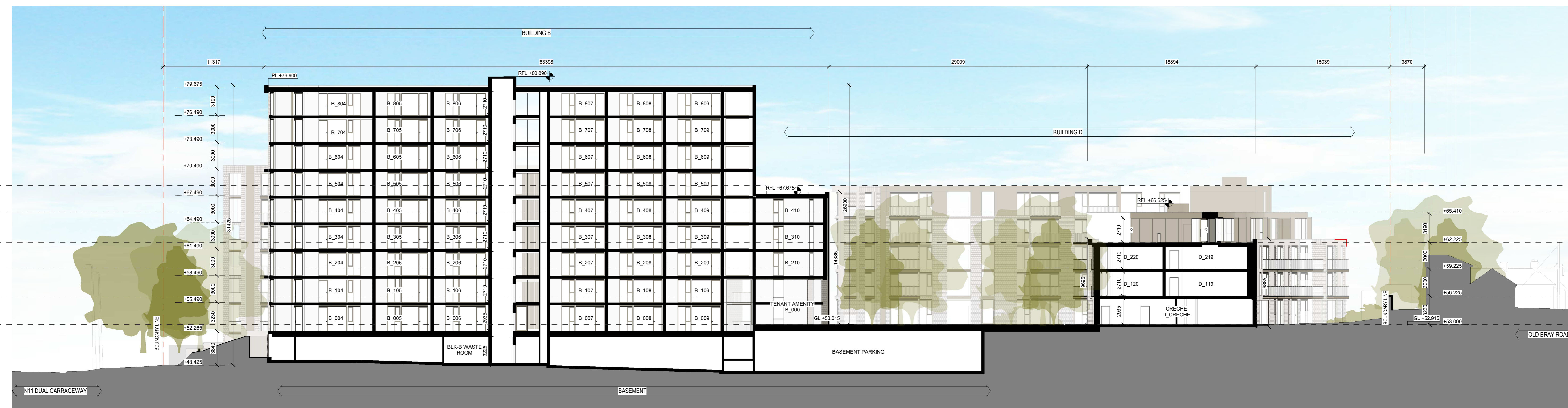
1 SECTION BUILDING B & D 1 : 200